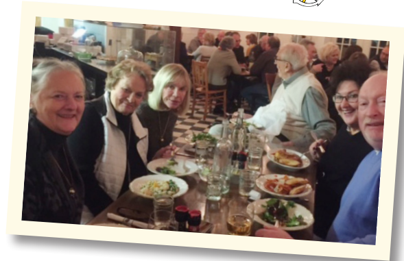
On-Shore Dinners kept the fun going all winter long.

The winter months are busy ones at LTYC. We've been busy getting ready for another summer and here are a few things you'll find that we've been up to: